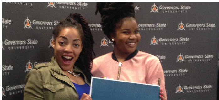
Participants at the Signing Day and Scholars Recognition for the White House Reach Higher campaign.