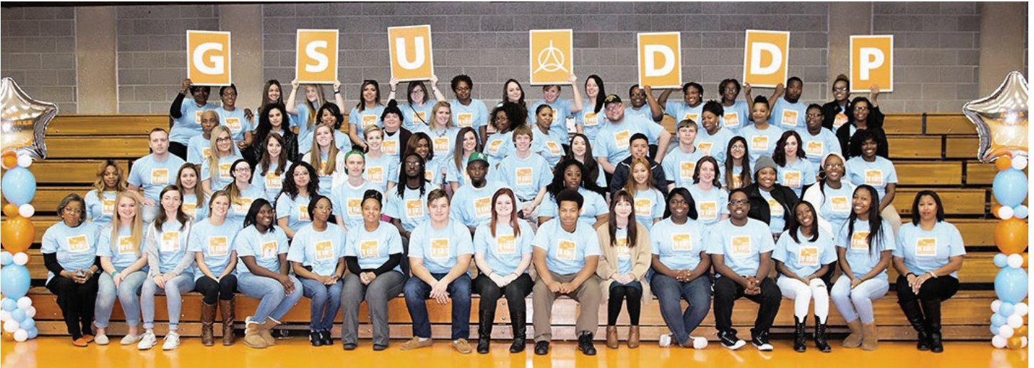
DDP Fall 2015 Induction Ceremony

The Dual Degree Program is a unique partnership between GSU and 17 Chicagoland community colleges that provides full-time students who have earned between 12-45 college-level credits hours with an excellent pathway to earn quality, accessible, and affordable associate and bachelor's degrees. In addition, DDP provides transition services and programs to DDP students who choose to attend GSU. DDP students have nothing to lose and everything to gain by enrolling in this free program. In total, 369 students were newly enrolled in DDP this year. To date, 403 students have transferred to GSU through DDP. During 2015 – 16, a record number 70 DDP transfer students graduated from GSU.