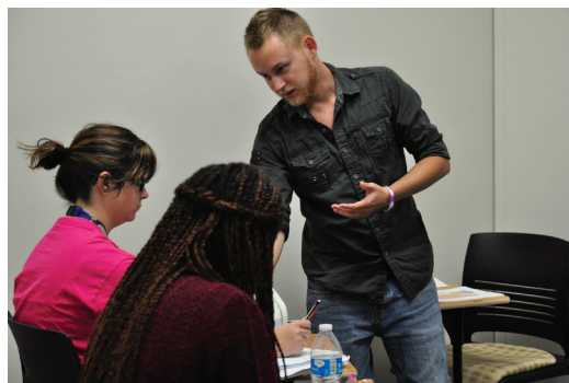
Tutoring is available in the Academic Resource Center, where student success is their number one priority!