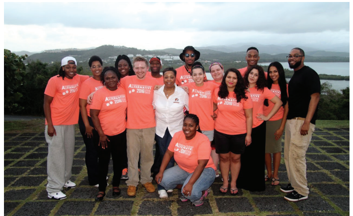
Alternative Spring Break 2016 at the Reserva Natural de las Cabezas de San Juan.