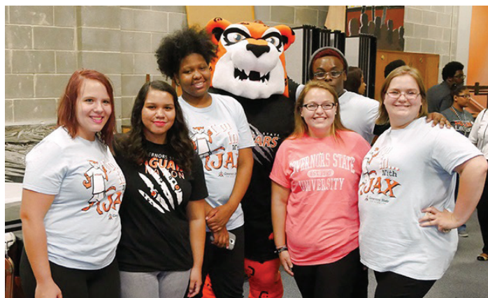
Students anticipating the start of Convocation and a new school year!